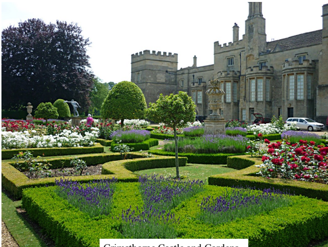
Grimsthorpe Castle and Gardens