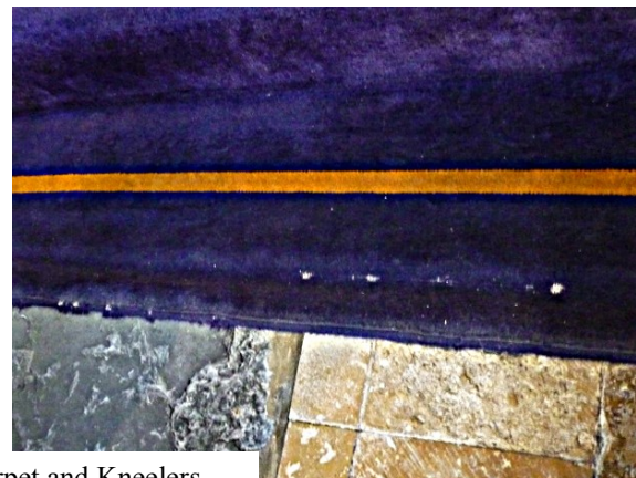
Seamens' Chapel - Worn Carpet and Kneelers