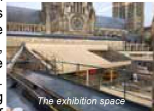
The exhibition space

identified audiences with which the Cathedral struggles to engage, including children, families and those living in deprived areas of the county. The project is therefore supporting an exciting and varied programme of activities and events, hoping to encourage a wider range of people to visit the Cathedral.