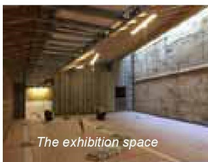
The exhibition space

One of aims of 'Lincoln Cathedral Connected', the banner under which these works have progressed, was to improve the Cathedral's hospitality and welcome for worshippers, volunteers and residents of Lincoln, as well as visitors to this magnificent City. Access has been at the heart of the project, resulting in raised ground levels at the West Front, a fully accessible visitor centre and provision of a Changing Places facility. Further to this, the project has