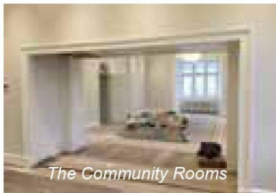
The Community Rooms

Landscaping on the Dean's Green is creating beautiful spaces for everyone to enjoy. Over the next few weeks, a sea of brown mud will turn a deep, verdant green as turf is laid.