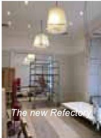
The new Refectory

As Spring approaches, the final touches are being put to the Old Deanery Visitor Centre. The 'ODVC' as it has affectionately become known, will house the Cathedral's refectory, shop, community rooms, education centre and exhibition spaces. The contractor, William Birch Ltd, has been on site since September 2018 and now, after 18 months, the end of their work is in sight. The tired Grade II listed building on Eastgate, which until a few years ago was home to Lincoln Minster School, has been transformed. Currently the decorators are putting the finishing touches to their handiwork and floors are being laid.